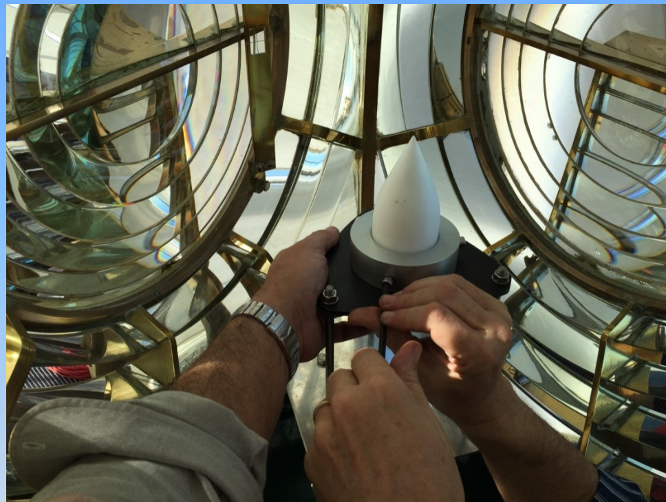
Adjusting lamp focus